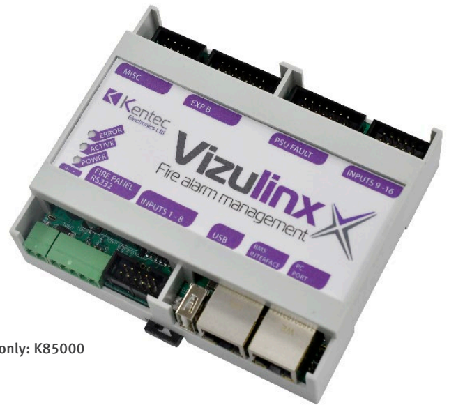
Module only: K85000