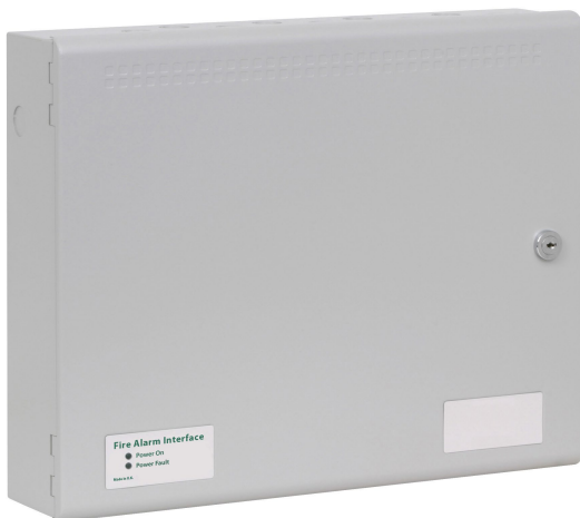
Housed version: K85000 M2

Provides building managers & service organizations instant updates on any faults & fire alarm activity, thus providing convenience and time-saving efficiencies.